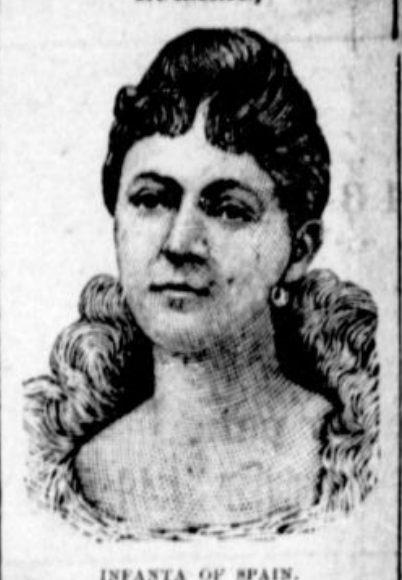
INFANTA OF SPAIN.

Our guests, Infanta Eulalie, of Spain, and her husband, Prince Antoine, of Bourbon, are having a good time of it. Infanta Eulalie is the daughter of Queen Isabella, a sister of the late King Alfonso, and aunt of the present King of Spain. Her title, Infanta of Spain, means child of Spain. In other times the King was considered the father of his country, but Spain was the only country where the King's children received the official title of "child of the country" (Spain). Infanta Eulalie is still young and has been married only a few years and has one child. Her husband is her cousin; her mother's sister having married the Duke of Montpensier, son of the late King Louis Philippe, of France. We heartily welcome the Nation's guests and hope they will have a royal, good time of it.