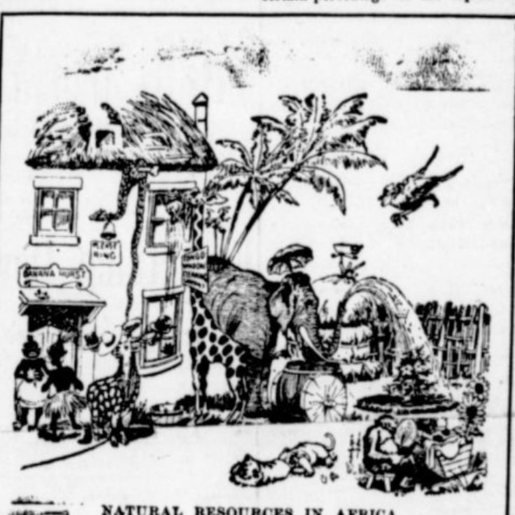
NATURAL RESOURCES IN AFRICA.