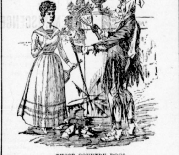
THOSE COUNTRY DOGS.