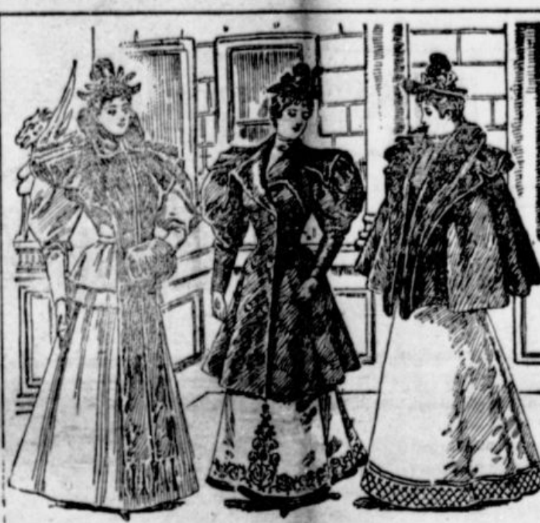
WRAPS FOR WINTER WEAR.

What has been called the Great American Desert covers an area of about 900,000 square miles in the United States proper. It includes Wyoming, Nevada, New Mexico, Arizona, Utah and a large part of Montana, Idaho, Washington, Oregon and Colorado. While there are many fertile valleys and immense areas suitable for stock ranges, most of this country is at a great elevation above the