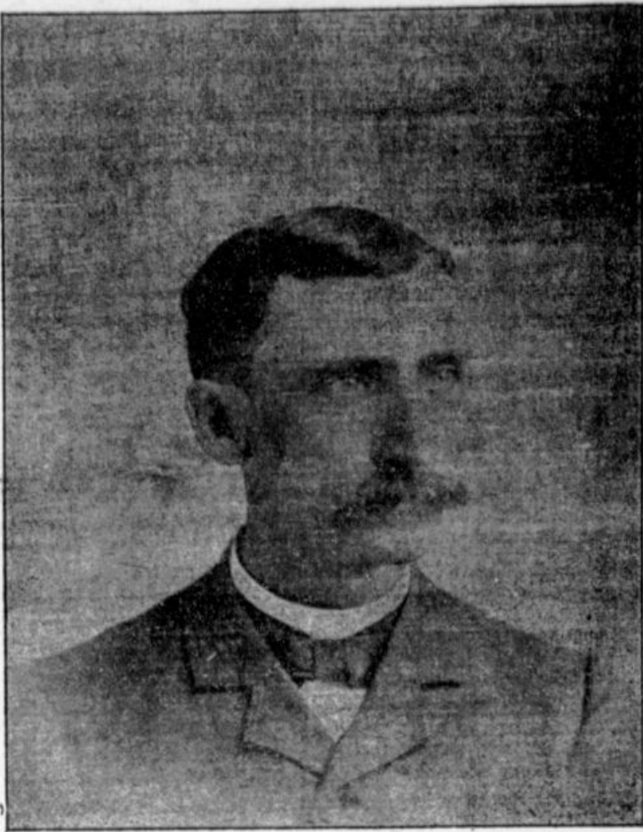
He Says the Roads Must be Worked.