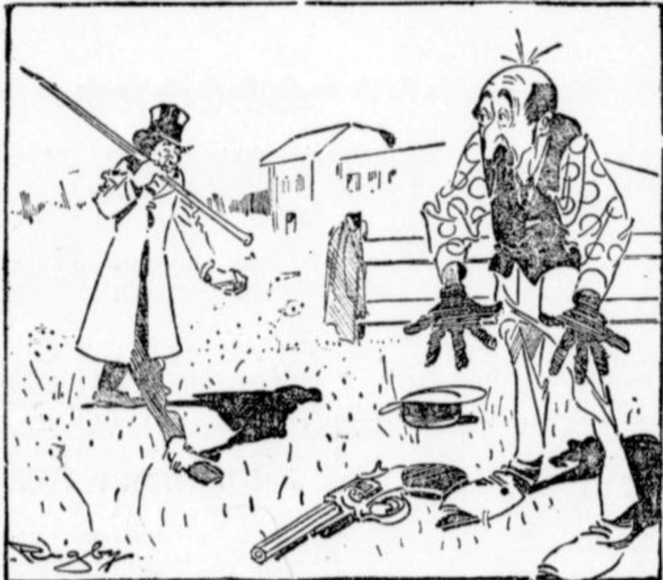
Come to Fight a Duel With a Cow Ear.

"As I conscientiously believed that my bill was for the best interests of the commonwealth, I pushed it as vigorously as I could. There were opponents by the dozen. Some I brought over to my way of thinking by argument and experiment, and some I called out. I cannot recall at this moment that any of the duels resulted fatally, but at least a few of them must have, and as I am here alive and well to-day it must naturally follow that the other parties sleep in honored graves. That bill would have gone through a-flying with an appropriation of $50,000, but I had introduced it according to war tactics—crush your enemy with one blow. The idea was to make such a wholesale attack all along the line that the pesky insects would be knocked out in a day."