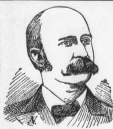
DAVID B. HILL.

The proceedings yesterday moved with great briskness. The aspect of the vast auditorium was truly democratic when the session began. Anticipating the close of the convention the general public was admitted freely, and as a result great crowds emptied into the body of the hall, not only filling every available seat in the area and aisles, but also overflowing into the arena reserved for delegates, while some more adventurous individuals scaled the iron girders and looked down from a dizzy height on the 30,000 people packed below. The crowd practically took possession of the proceedings, and at times the chairman and his officials were so powerless to proceed that they gave up to the multitude