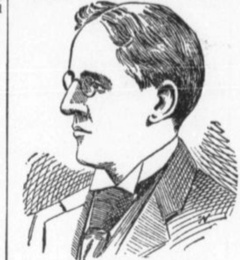
CHARLES A. TOWNE.

When the demonstration had subsided, Grady completed his speech placing Hill before the convention. But as he stepped from the platform, the man who had just been placed in nomination took his place. The senator looked out sternly, even savagely, on the shouting thousands. When he could be heard, he made due acknowledgments of the honor done him. "But I can not, I must not, be the nominee of this convention," he declared, with explosive emphasis. He was frequently interrupted with enthusiastic shouts of approval, but when he left the platform the delegates were firmly convinced from his words and manner that he was sincerely desirous of having his name withheld. It is possibly this alone which prevented a nomination by acclamation then and there, for the tempestuous spirit man-