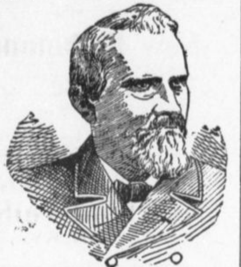
SENATOR J. K. JONES. (Chairman of the National Democratic Committee.)

Kansas City, Mo., July 5.—The first day of the Democratic national convention, Wednesday, failed to witness the nomination of Bryan as the presidential candidate, as was desired by some of the party leaders, who wished to add a patriotically sentimental eclat to the nomination. The hitch occurred on the silver question, the resolutions committee being deadlocked over the question of submitting a straight-out sixteen to one silver plank, or simply reaffirming the Chicago platform. The convention, therefore, confined itself to routine business, and in the three sessions held proceeded as far as the permanent organization, thus clearing the deck for the reception of the report of the committee on resolutions and the placing in nomination of candidates for president and vice-president.