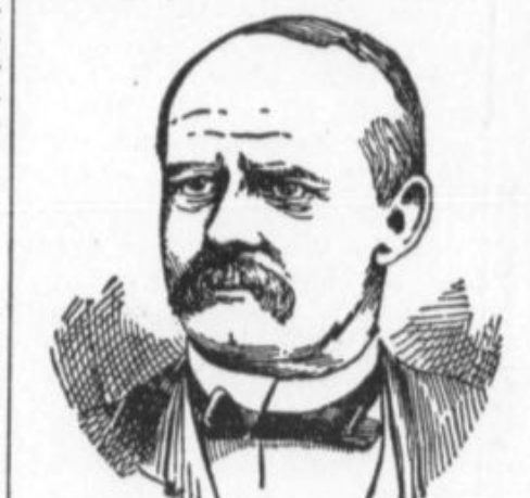
HON. ADLAI E. STEVENSON.

It was after two o'clock when the seconding speeches, many of them wear-