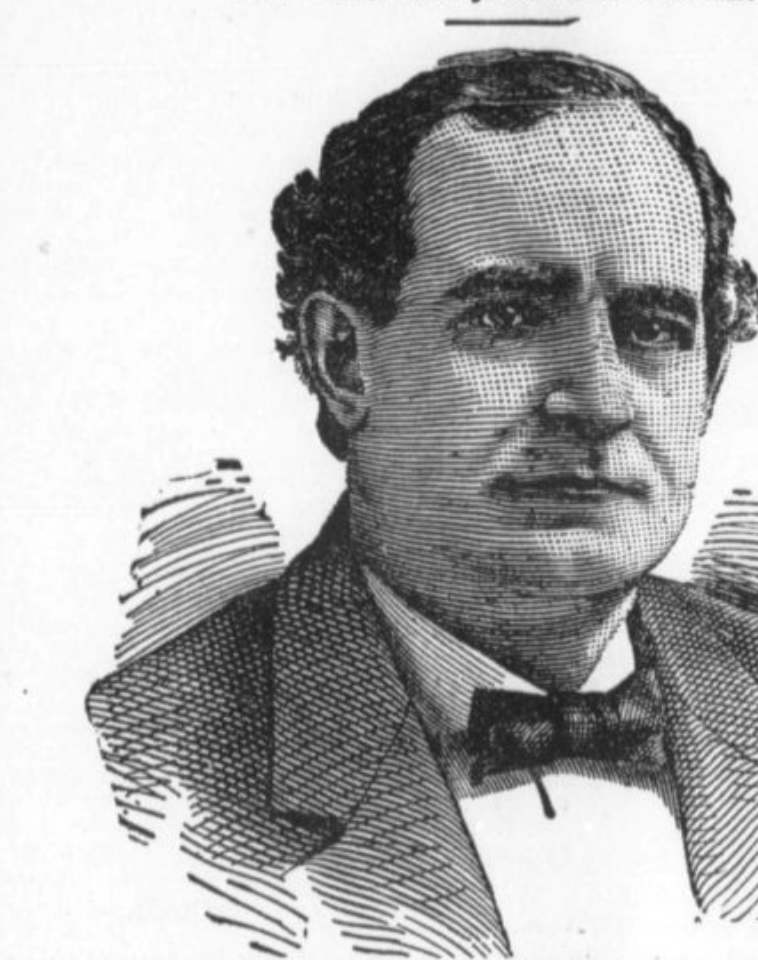
DEMOCRATIC CANDIDATE FOR PRESIDENT OF THE UNITED STATES.

and territories. The convention managers had already agreed that this was sufficient work for the day and the vice-presidential nomination was allowed to go over until to-day.