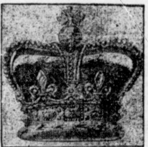
THE BRITISH ROYAL CROWN. (Worn Only During the Coronation Ceremonies.)

Edward I, surnamed "Longshanks," was born at Westminster in 1239. He participated in the seventh crusade and was returning from Palestine when he heard of his accession to the throne. The most notable acts of his career were the banishment of all Jews from England and his defeat of