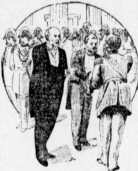
DIPLOMATS ENTERING SENATE CHAMBER.

British Ambassador Pauncefoot is a typical British gentleman; large, strongly proportioned, of grave mien,