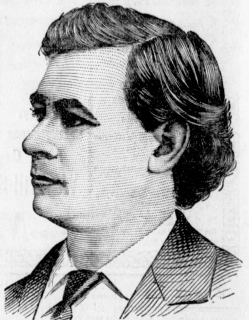
CONGRESSMAN HOWARD OF ALABAMA.

A Remarkable Case Reported From the State of New York.