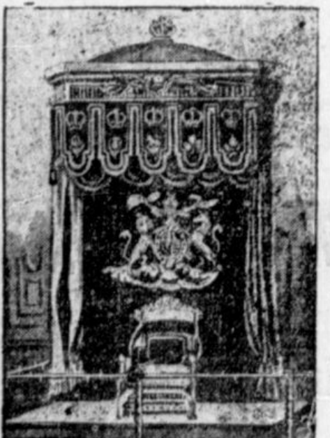
BRITAIN'S ROYAL THRONE. (Located in the Throne Room of St. James Palace.)

In ancient times the newly made monarch was clothed in the royal trappings and wore the royal crown when going through the ceremony here described. The prince of Wales became King Edward VII. without these gaudy accessories. He wore a field marshal's uniform with the rib-