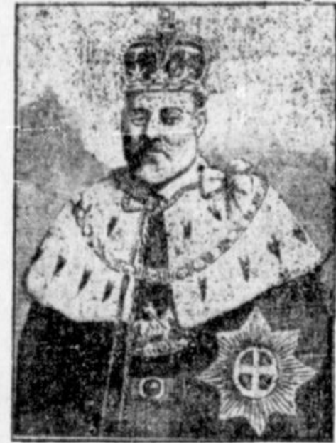
KING EDWARD VII. (Clothed in Full Coronation Gown and Wearing Crown.)

T IMES change, and men change with them. This old maxim is applicable to almost everything under the sun, except to the red tape ceremonials of European courts. That is why the prince of Wales was proclaimed king of Great Britain and Ire-