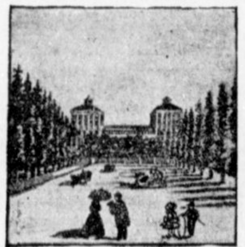
THE CAPITOL IN 1814.

Continued efforts were made to have the first idea carried out, and the result was the passage of the act for a "permanent system of highways." This act provides for the recording of extension plans with the surveyor and for condemnation proceedings. There has therefore been no necessity for a hurriedly prepared plan of extension, and the commissioners