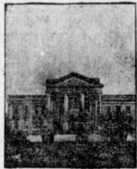
NORTH VIEW OF WHITE HOUSE.

In the agricultural or unsubdivided parts very little condemnation will be necessary as it is expected to get the streets when subdivisions are made. The plans of this first section cover about 30 good-sized maps, showing all details necessary for a complete record. The localities of all proposed avenues are given upon every lot line that is crossed as well as the area taken. Most of the streets have been retained and widened, the rectification being mainly by the extension of par-