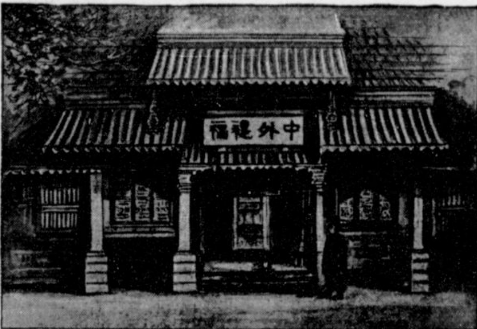
CHINESE FOREIGN OFFICE AT PEKING.

Leaving aside the railroad question, Manchuria is a country well worth striving for. It occupies 375,000 square miles, is drained by several large river systems, including four navigable waterways, the Sungari and Nonni on the north and the Yalu and Liao on the south. Its entire area is tributary to the sea and to the commerce of the world through an extensive coast line on the Gulf of Pe-Chi-Li, with safe and commodious harbors at Port Arthur, Newchwang and Tientsin. The climate of the country varies from the semi-tropical to the temperate. In the south citrus fruits are grown successfully. The central and northern parts produce fat crops of wheat and other cereals. Gold and silver have been mined in the mountain ranges of the west for many years, and