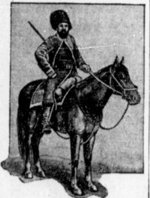
URAL COSSACK GUARD.

It has been intimated that Li Hung Chang, in 1895 as well as now the most astute as well as far-sighted of oriental statesmen, was persuaded by Russian gold and Muscovite flattery to advocate the establishment of close relations between St. Petersburg and China, and the granting of the Manchurian railroad concession was the first step in carrying out the new policy. With these facts in view it becomes apparent that Manchuria has in fact, although not in name, been a Russian colony ever since 1895; and it may be taken for granted that Russia will not relinquish its hold upon it. Some of the clauses of the