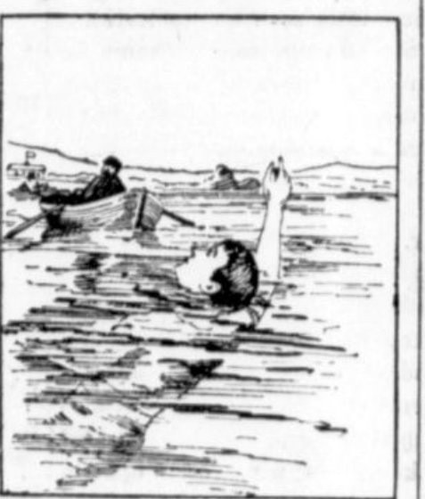
JUST BEFORE DROWNING.

"The more I think of this phase of the drowning question the more remarkable it seems. Boys have been drowned here who would have been rescued had they but called once. They have gone under surrounded by companions and so close to the life guard that rescue would have been