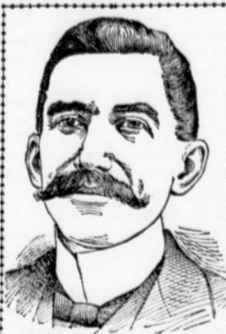
CONGRESSMAN R. W. WILCOX, Delegate to Congress from Hawaii.

Hon. Robert W. Wilcox, Delegate to Congress from Hawaii and the Sandwich Islands, in a recent letter from Washington, D. C., writes: