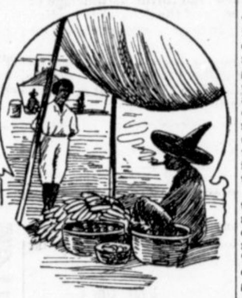
AT THE PORTO RICO MARKET.

A hungry-looking dog ran out to them from one of the doors. Farther on a lean pig tried to follow them, but it was tied fast to the doorknob. Soon they met the milkman driving