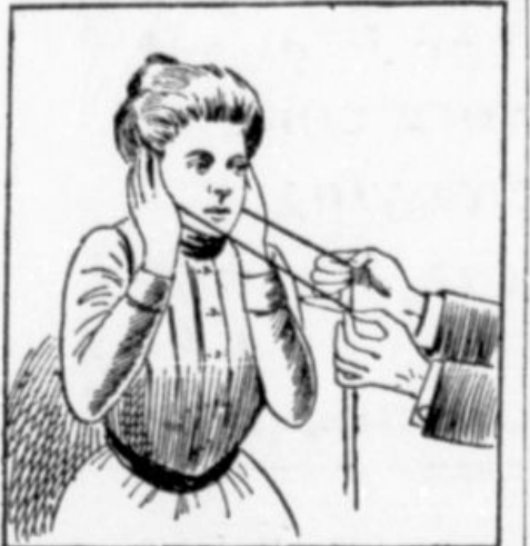
HOW TO MAKE THUNDER.

Get a piece of ordinary twine two or three feet in length, and place it around the back of your head, according to the manner shown in the accompanying picture. Next bring the two ends forward past the ears, or, rather, past the auricles. The ears must then be closed by keeping the fingers