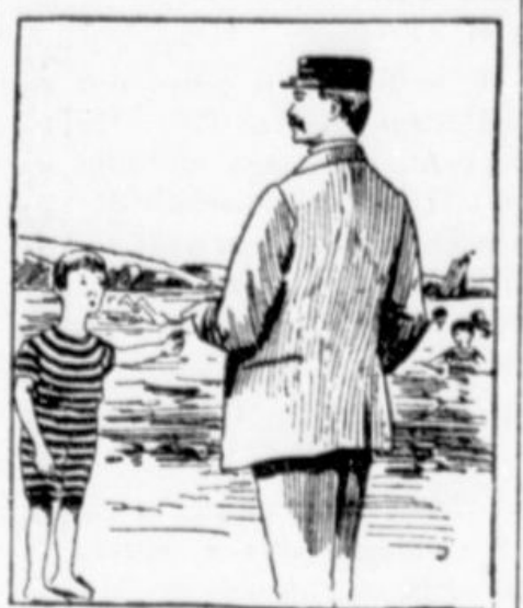
"I'VE JUST COME IN, MISTER."

"As soon as the alarm is sounded everyone is called from the water and