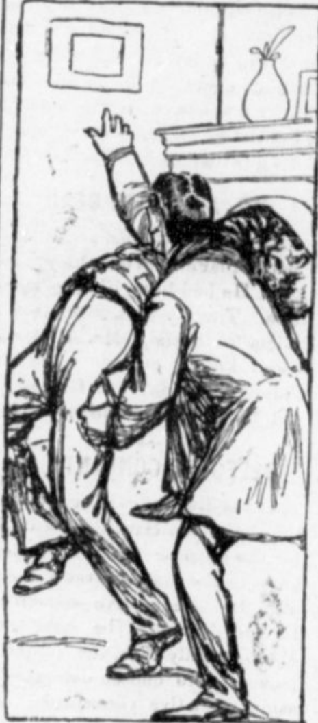
THE STRANGER'S RIGHT ARM SWEEP AROUND UNDER THE COLONEL'S CHIN.

Two weeks passed and the police still reported no clue. In other words, the complaint had been pigeonholed along with hundreds of others of no more im-