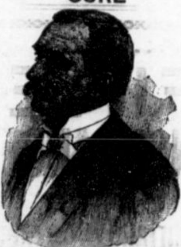
(This Picture on Every Bottle)