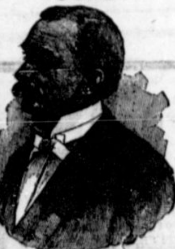
(This Picture on Every Bottle)