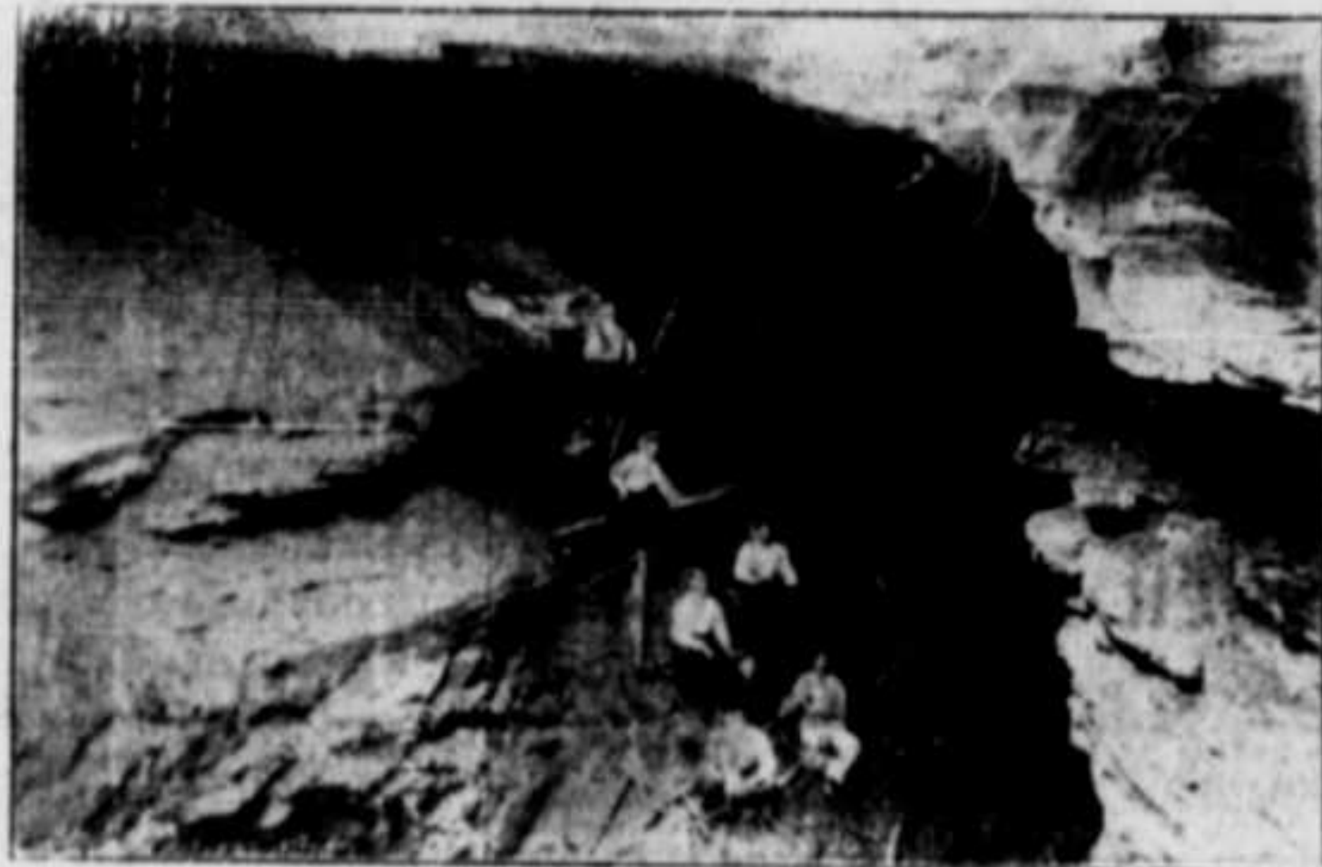
IN THE CAVE ON THE TRIGG COUNTY PROPERTY.

Four of the largest smelting companies at Joplin were competing for the limited supply, and, as is always the case when the reserve stock is low and the supply short, little attention is paid to an assay basis when the ore is so badly needed. It was a market when any price was paid to get the ore. The shortage in the supply is caused by several large producing mines