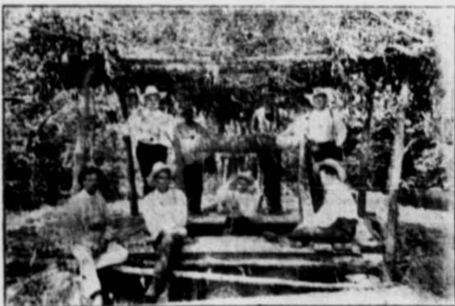
THE TRIGG COUNTY ZINC, LEAD & FLUOR SPAR CO.