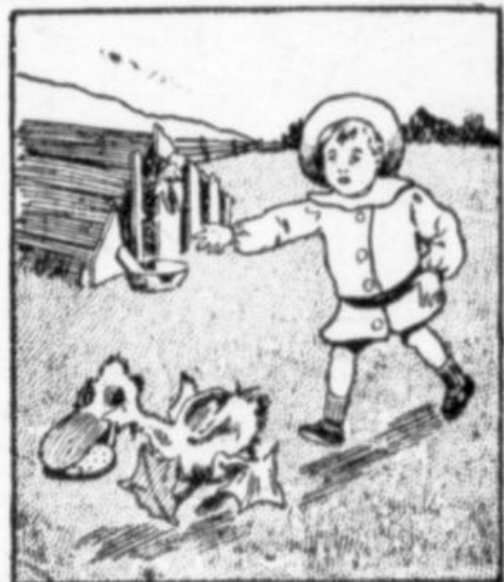
POOR BILL GAVE UP THE CHASE.

"See what you have brought me to by your greediness," said his poor mother.