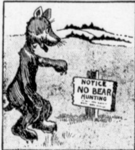
JIM READ THE SIGN.

"I shall go where there are no gun- ners," said he as he left his father's roof. He traveled and traveled until