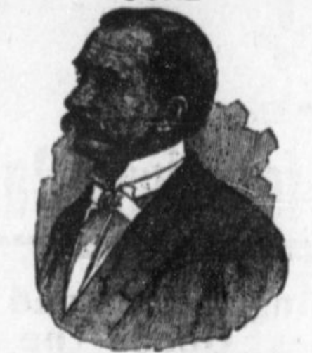
(This Picture on Every Bottle)