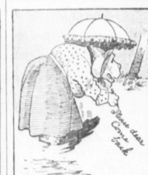
TOOK A STICK AND WROTE ON THE SAND.

"He meant me, of course," she said to herself. "Then I must be handsome after all, and he did say that he would