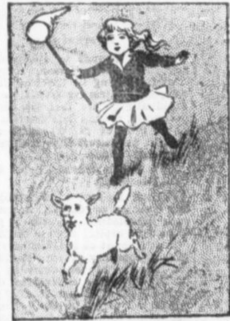
RAN AWAY AS FAST AS HE COULD.

"I do believe that bad lamb is frightening the butterflies away!" cried