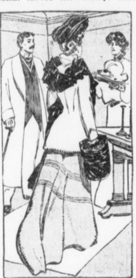
"SOME ONE WAS ABSENT FROM BUREAU."