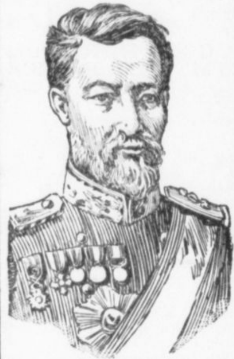
VICE ADMIRAL HEHATCHI TOGO, THE JAPANESE NELSON.

Born on Oct. 14, 1857, young Togo was educated at the Japanese war college and at the Incorporated Thames Nautical Training college on board the British training ship Worcester. He also studied at the naval college at Greenwich and made a voyage in a British man-of-war. During his studies in England he showed great aptitude in naval matters and an ability which foreshadowed his future greatness. Although young, as flag officers go, Vice Admiral Togo, of all the available admirals in the Japanese navy, probably best knows what naval warfare under modern conditions means. Ten years ago, when the Japanese wiped out the Chinese fleet, Admiral Togo, then captain, struck the first blow of the war. He was in com-