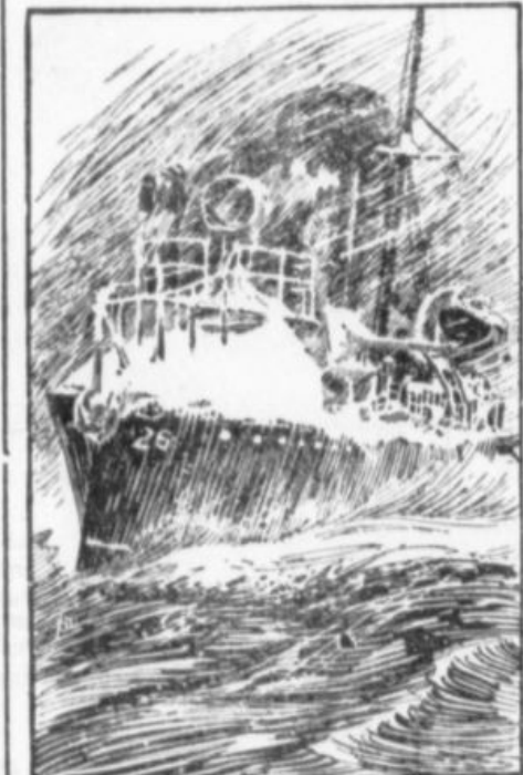
JAPANESE TORPEDO BOAT IN WINTER OFF PORT ARTHUR.

When it is considered that in the recent assaults on the Russian ships at Port Arthur the sea and harbor were