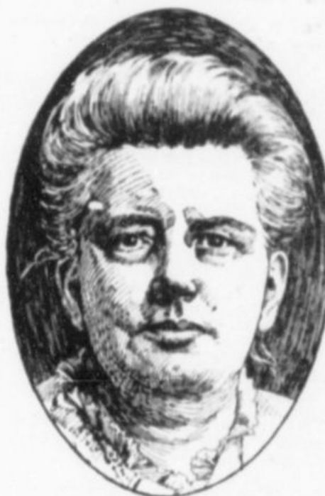
REV. ANNA HOWARD SHAW.

Leaving the university, Miss Shaw became pastor of a Methodist church