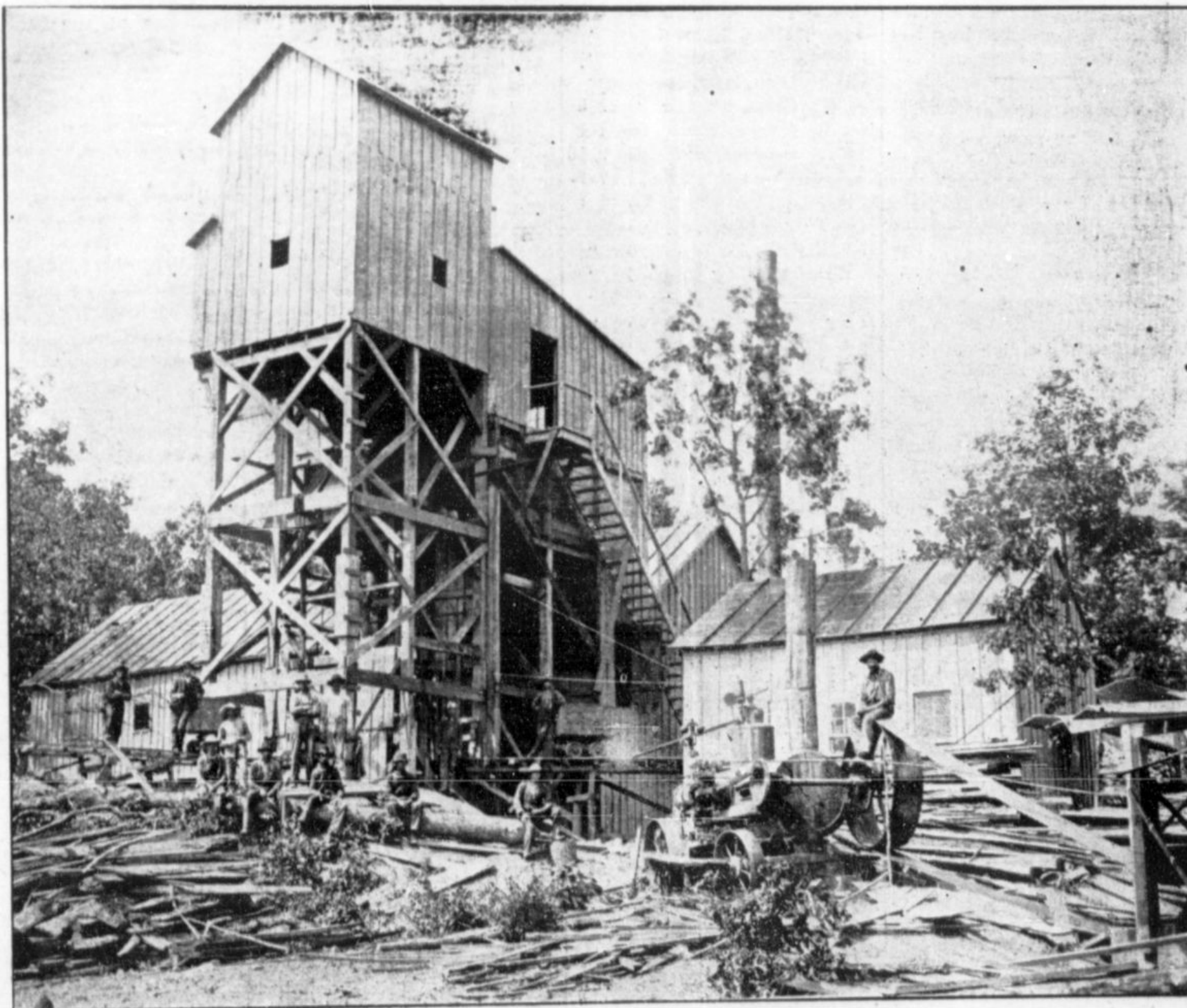
Outside View of the Great Riley Mine in Crittenden County.