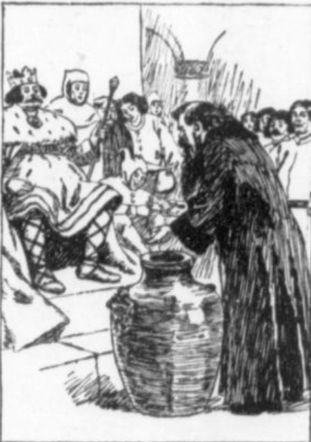
"THEN I HAVE FAIRLY WON THE GOLDEN BALL."

"May it please your majesty," said the old man, "your most excellent