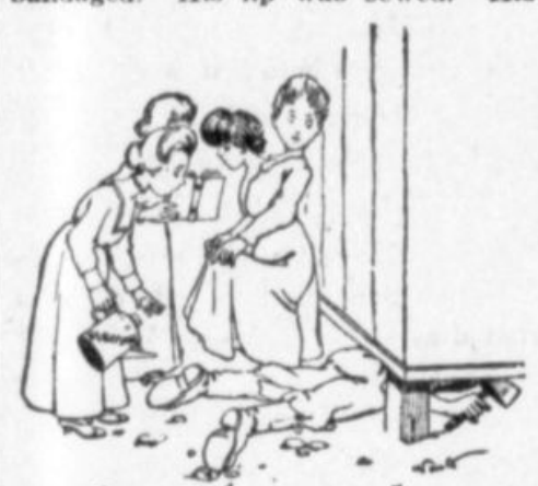
SQUEEZIN' INTO A TWO FOOT SPACE TO KILL A WOODCHUCK.

the pieces together as near as we could judge where they belonged and stretched the result on the parlor couch. There's no gettin' around the fact that Billings is homely when he is whole, but, viewed as a lot of fragments, he was enough to give a man the nightmare. His left arm was bandaged. His lip was sewed. His