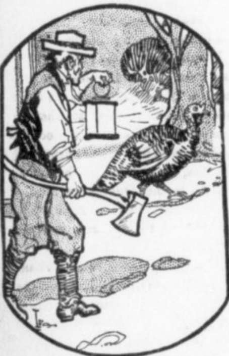
The farmer looms in the lantern's light.

MID the falling flakes of a wintry night The farmer looms in the lantern's light, And with gleaming blade and a final flop A foul deed's done for the poultry shop.