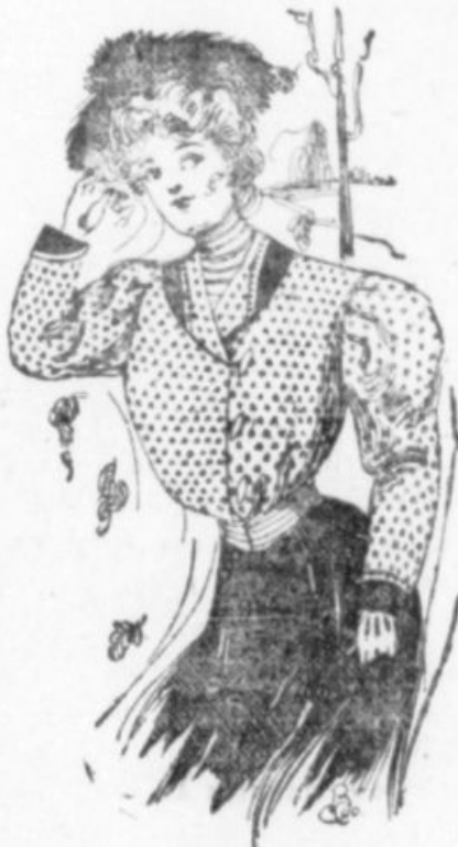
STYLISH AND SERVICEABLE IS THIS NEW MODEL LOOSE SWEATER.

The scarlet Norfolk, belted and buttoned down the front with white pearl buttons, is exceedingly smart this season and delightfully comfortable for golf or tennis. Beneath the box coat the sweater blouse is conveniently worn. Most of these are made with knitted rolled collar, which may be turned up around the throat if desired. Some smart new models are of white, with collars and cuffs of modish colors. A loosely knitted white sweater was a blouse model with a broad stylish collar of dark blue and green, closely knitted in blended stripes. The front