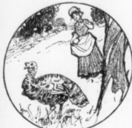
A bright eyed lassie pursues the quest.

BUT the shy bird vainly seeketh a screen In distant cover of vernal green, For a bright eyed lassie pursues the quest Till she discovers the stolen nest.