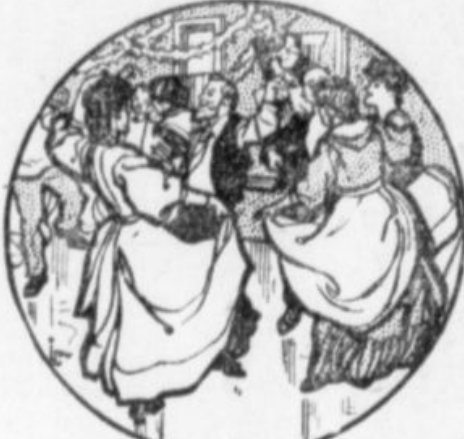
Fiddler, let 'er go!

Swing back the smokehouse door, there, An' take a peep within! Those hams so brown an' hangin' down Say, "Let the feast begin!"