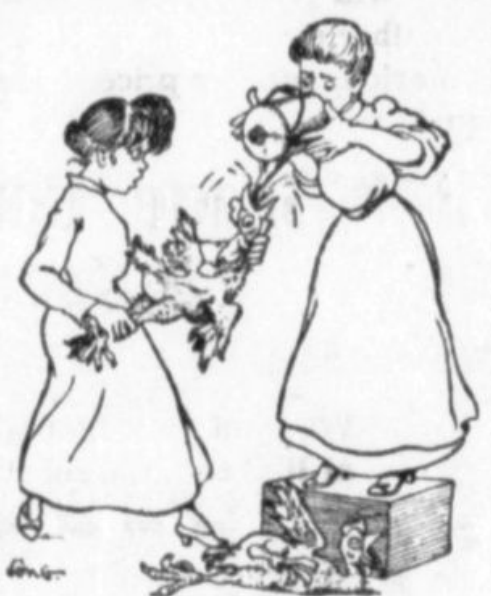
THEY POURED KEROSENE DOWN 'EM.

Well, as all the fools ain't dead yet, her dear Uncle Mort let him come. He proved a likely fellow, with a heap of common sense back of the homeliest face I ever saw move on legs. That is, he exhibited a deal of sense until he had