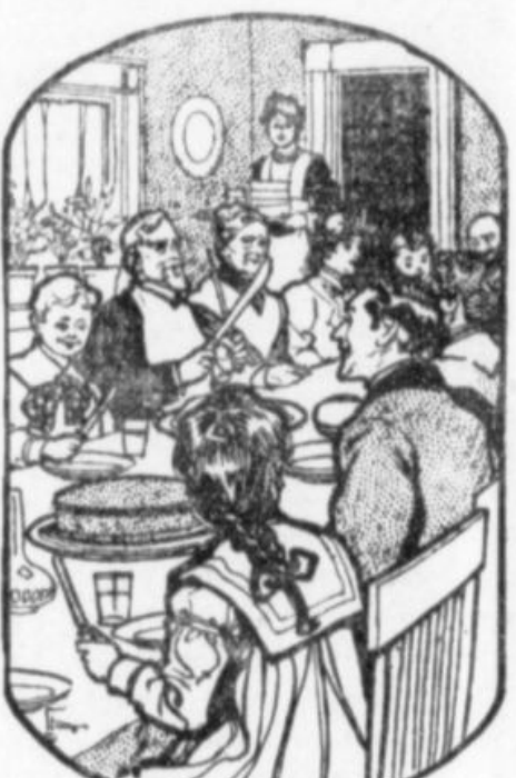
Let the feast begin.

Tune the fiddle, strain the string, Rinse well the bow; Get yer pardners on the floor— Fiddler, let 'er go!