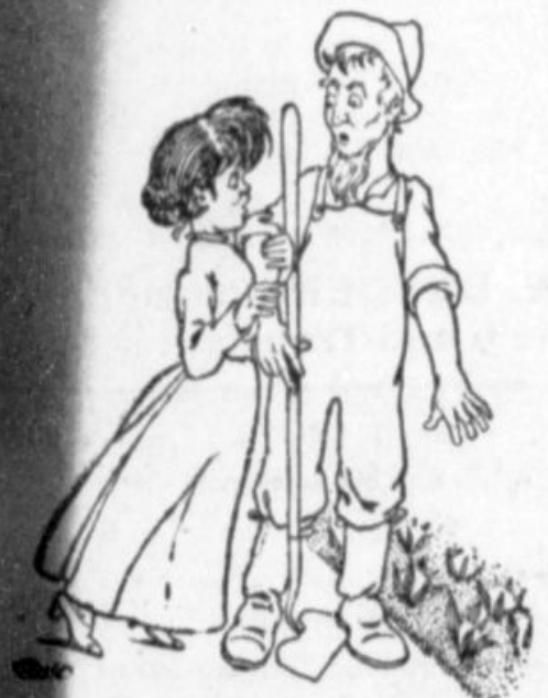
HER "DEAR UNCLE MORT."

There's four of 'em, and each has just as little sense as the others unless it's Helen. She's the youngest, and has either more or less, I ain't decided which yet. She's little and thinks she's cute. They always sent her over to ask me to do any of them little acts of "neighborly kindness" that kept me on the jump for a year. Her plan of attack was to hook her hands over my arms and shake her topknot over her eyes and hiss in baby talk to her "dear Uncle Mort" until I felt so like an idiot I couldn't think of a blamed ex-