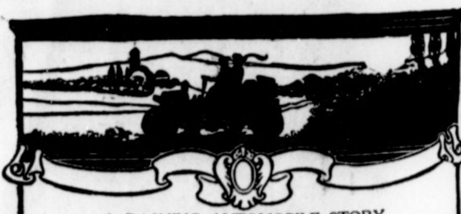
A DASHING AUTOMOBILE STORY

"It's so long since you sang," said the penial sun to the frozen brook. "I suppose when you get started again you'll bubble some old chestnut." "Juth tell them that you thaw me," lisped the brook faintly.