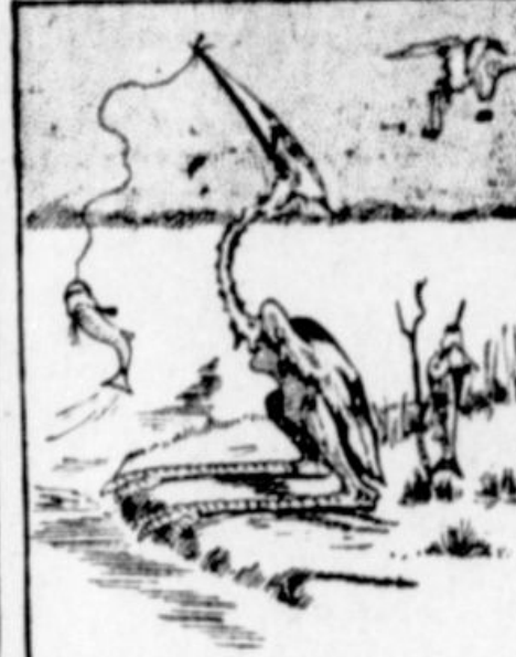
UP WENT HIS LONG NECK.

"You're right there, old man," said the Yellow Ned as he slipped out of