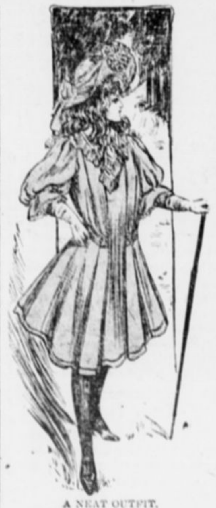
A NEAT OUTFIT.

Long-waisted linen dresses look so cool and comfortable, and many of them will be seen this summer. They may be bought ready-made, or easily fashioned at home. The loose coat