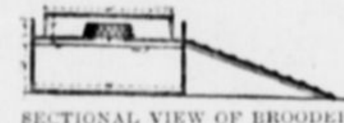
SECTIONAL VIEW OF BROODER.

old packing case, which will accommodate 50 chicks. The details of the construction are shown in the illustrations. The lower section of Fig. 2, where the lamp for heating is placed, is a box three feet square, made of ten-inch boards, and covered with tin or galvanized iron. Above this cover, around the edges of the lamp box, one-inch strips are nailed. Two one-inch holes are bored through these strips on each side of the box for the