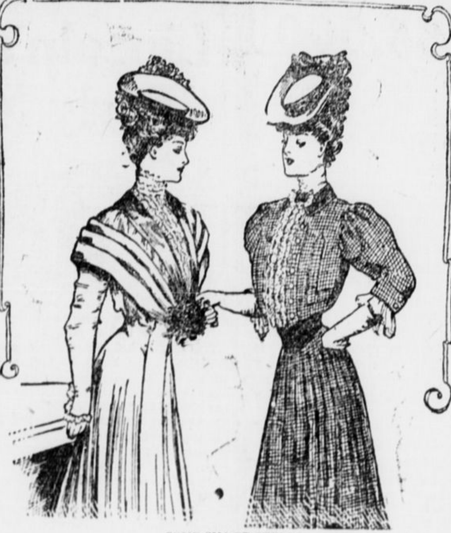
SOME SMART STYLES.

If you, or any member of your family, can do fine handwork, you are most fortunate this year, for this is the day when the pushing, boastful sewing-machine must take a back seat. Hand-sewing has "come in" with a vengeance, retiring machine-made work into the background with the folk that set the pace in dress. And so the modest little woman with skill in her fingers may make for her own women folk the fashionable frocks and blouses of the day that will compare with the $30 and $20 lingerie waist purchased at the shops. A good pattern secures the right cut, the handwork is then the whole thing.