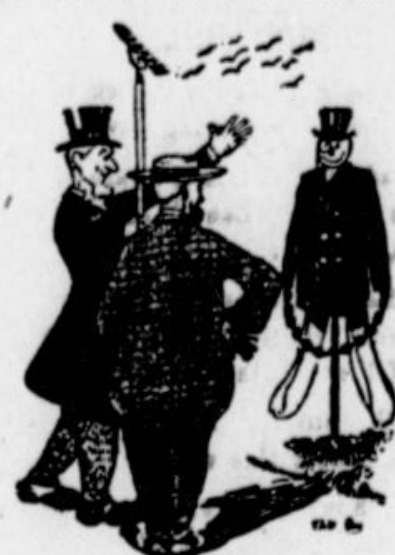
New Styles in Scarecrows.