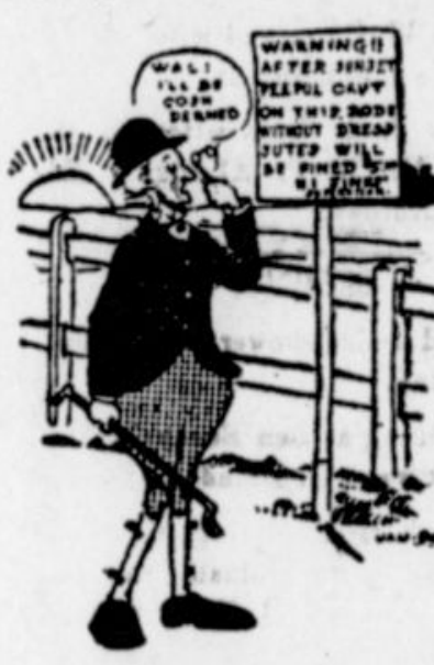
Stung! by Jinks!