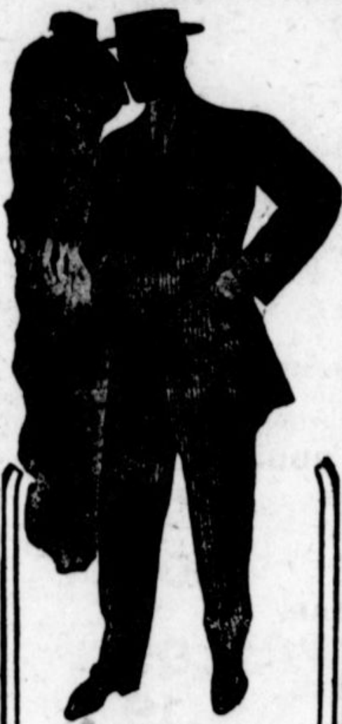
Mark Twain said: