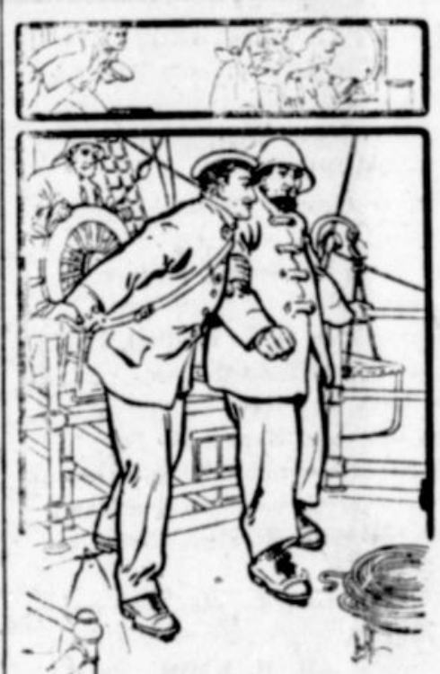
See Here, Mr. Tuttle, Kindly Explain What You Are Driving At.

I was aware that he watched me closely as I descended the steps, but felt little interest in such surveillance. That we could have been guilty of so serious an error as he suggested was beyond possibility. Nevertheless the mere suspicion was irritating, leaving me filled with a vague unrest. It was quite true that I might have been deceived. I realized that, because I had enjoyed no opportunity to observe the Esmeralda in daylight, and no occasion to study her lines with care at any time. To me she had appeared merely as an extremely graceful vessel, interesting to the eye of a seaman. But Tuttle and his crew must have known the truth. If we were, indeed, on board the wrong vessel, it was from no innocent mistake of the darkness, but rather the result of deliberate plan, the full purpose of which was beyond my comprehension. I swore savagely under my breath, even as I halted sarcastically at the vague suspicion, aroused halfily, as I well recalled, by my increasing dislike of the wheelman. The wrong ship? Why, the very conception of such an accident was grotesque, ridiculous, be-