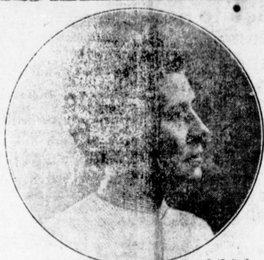
IDA M. TARBELL Remarkable Historian and Writer

One of the greatest living historians is a woman—Ida M. Tarbell, who evolved from a chaos of facts and figures a clear, orderly, concise and consecutive history of, perhaps, the greatest business organization in the world. With the sure instinct of the true historian, she gathered the vital facts in the rise of this great institution and presented them in their true relation with conscientious loyalty to truth, with courage in stating boldly her findings, and with an absence of prejudice that is rare, indeed, in writing on such a theme. The work is more than a mere history of an industry; it is the biography of a genius in organization and the vivisection of a typical Trust combined in one masterly work—"The History of the Standard Oil Company." This is but one of the splendid pieces of literature to the credit of Miss Tarbell.