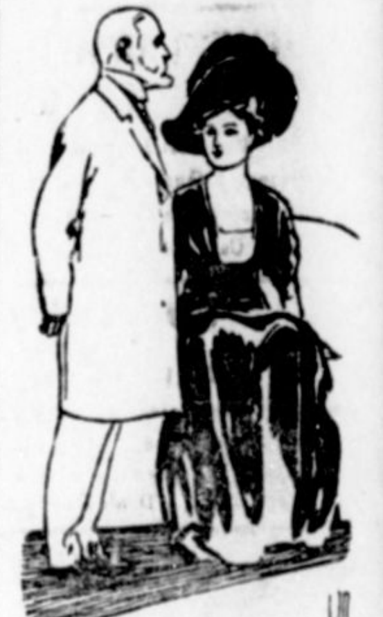
"This doesn't come under the head of social duties."

"Father," she said, "I want you to know that I've been to five teas this