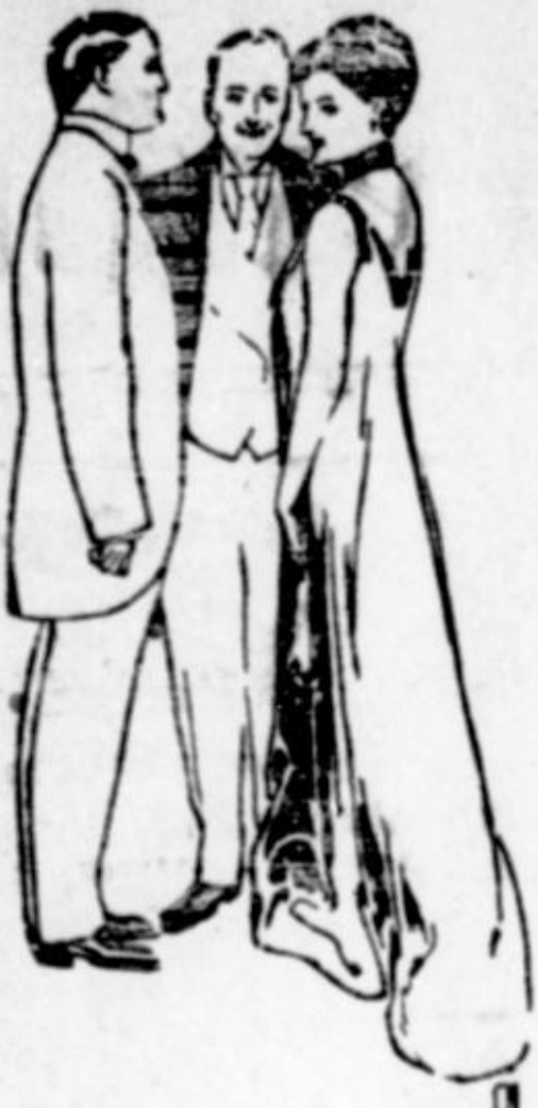
"People who live in le-houses shouldn't throw hot water."

case," remarked Brand in defense. "We merely print the facts."