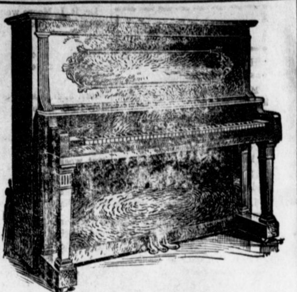
The above is a picture of the Wellington piano to be given away October 29, to the lady securing the greatest number of votes in the Record-Press Prize Contest.