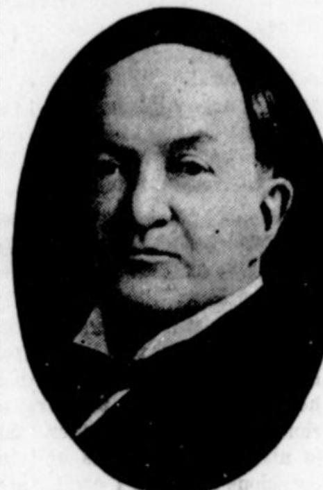
GOV. JAMES B. M'CREARY.

While her sister States are developing and utilizing every advantage, Kentucky must go forward also. We are in an age of progress and development, and the pulse and pace of the