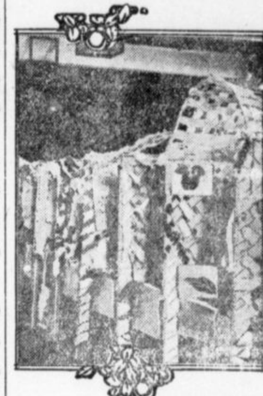
LINE OF SCHOOL BOOTS.

A circus can bring a crowd into a town that will tax the livery stables and side streets, but a school fair and parade can do the same. On Oct. 26 Bowling Green was crowded, crowded as if a show was in town, but there was a difference. It was a crowd of eager, expectant people, with eyes looking far beyond the mere parade; it was a crowd that marks the awakening of a state that had dozed comfortably for