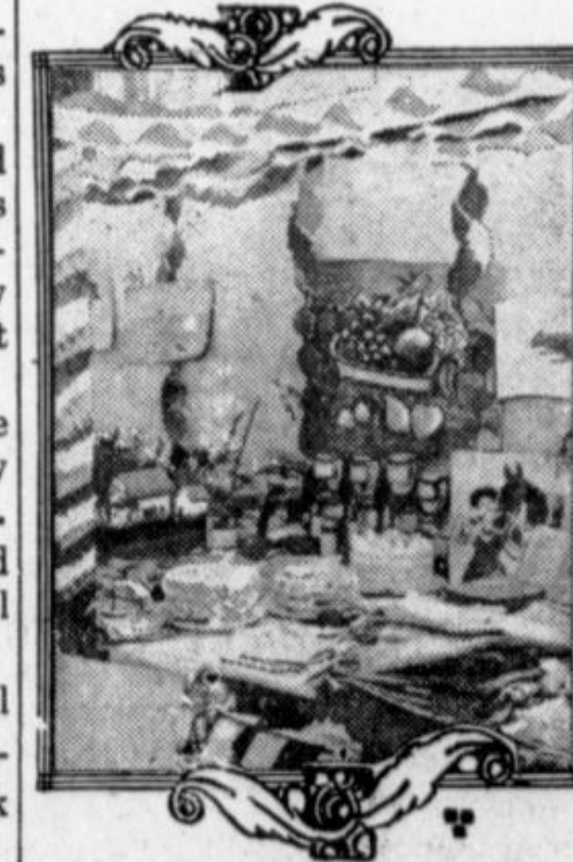
AFRONS, CAKES AND JELLIES.

Back to the top of the hill on which the buildings of the Western Normal rest went the line of march. Behind them went the throng of parents and friends to have a look at the display of the Boys' Corn club of Warren county and the exhibits of the schools. In one of the large rooms at the school booths were arranged that each district school might have a distinct space for its handiwork. A walk among these booths showed beaten biscuits, cakes, bread, preserves, jellies, garden vegetables, doll furniture, sewing of