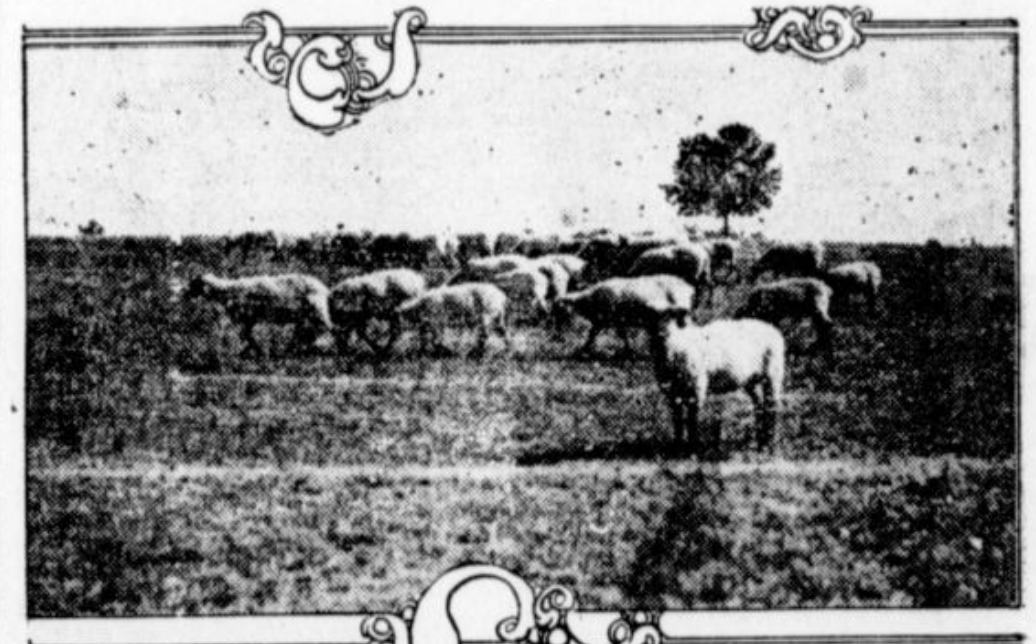
SOME HAMPSHIRE DOWNS.