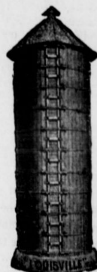
The Louisville Silo is the Farmer's Bank.

Satisfied Customers Are Our Best Arguments. Order early and Get Discount.