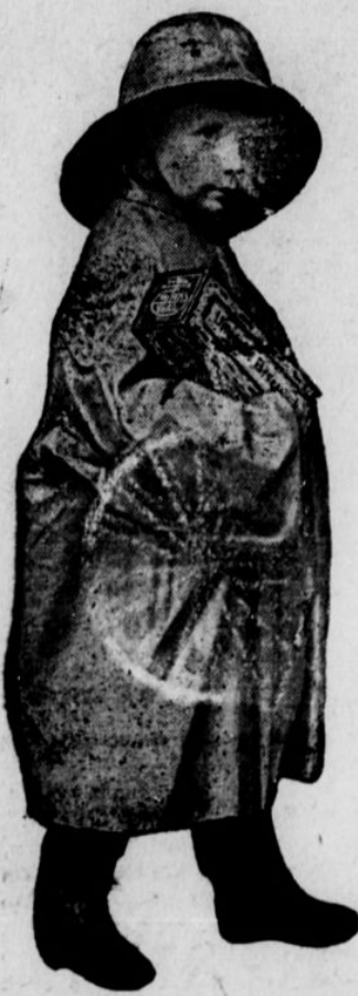
The Uneeda Boy, with crackers, Lemon snaps, and cakes; Fig Newtons, with nabiscoes, Is what Grandma thinks are great.

3 cans of salmon for 25c. Grape nuts 15c per package. Red Cross Macaroni 10c a pkg. Box salt 5c. Monarch Catsup 15c a bottle. Genuine Deviled Ham 15c. Pimentos 10c a can. Bottle pickles 10c a bottle. Peanut butter 10c. Tablets and pencils for the school children. Call and see our stock.