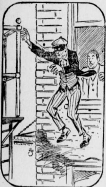
Made a Wild Leap for the Fire Escape.