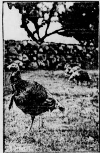
Healthy and Active Type.

whole oats, two parts, increasing to ten parts in two weeks; cracked corn, ten parts.