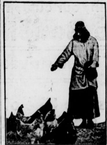
Feeding Unconfined Flock.

Unlimited range has its advantages, but if unlimited range means that the fowls have the privileges of the stables, wagon sheds and roosting on the wheels and machinery, then the unlimited range is a nuisance. To give