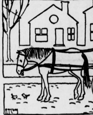
"I'm So Thirsty," Said the Horse.

"Thirsty," said the Princess Joy. "Why doesn't your master give you something to drink? You're a good horse. You go wherever he wants you to go—and so willingly too. You're so