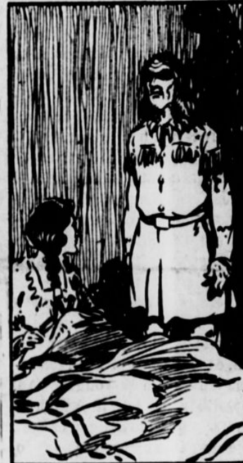
He Told Her He Was a Witch.