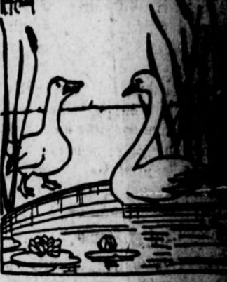
"Good Morning," Said Mrs. Goose.

Madame Swan made no answer, she didn't want to quarrel with