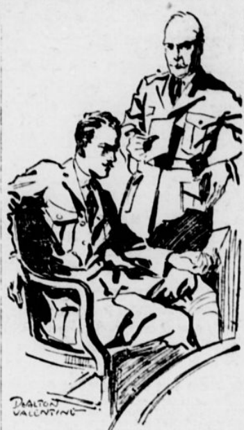
"That's the Woman! How Do You Like the Look of Her?"

The general watched his face with eyes that missed nothing. "Remember—I said work with her!" King looked up and nodded. "They say she's three parts Russian," said the general. "To my knowledge she speaks Russian like a native, and about twenty other tongues as well, including English. She was the girl widow of a rascally hill rajah. I've heard she loved her rajah. And