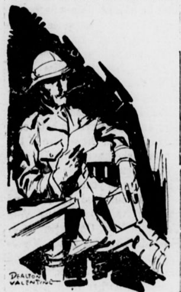
"Come at Once," It Said.

Athelstan King, for instance, nothing yet but a captain unattached, sat in meagerly furnished quarters with his heels on a table. He is not a doctor, yet he read a book on surgery; and when he went over to the club he carried the book under his arm and continued to read it there. In the other room where the telegraph blanks were littered in confusion all about the floor, the other officers sent telegrams and forgot King, who sat and smoked and read about surgery; and before he had nearly finished one