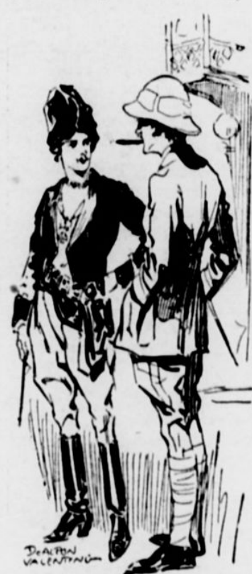
"I Have a Message for You."

The man was a regular Rangar dandy, of the type that can be seen playing polo almost any day at Mount Abu—that gets into mischief with a grace due to practice and heredity—