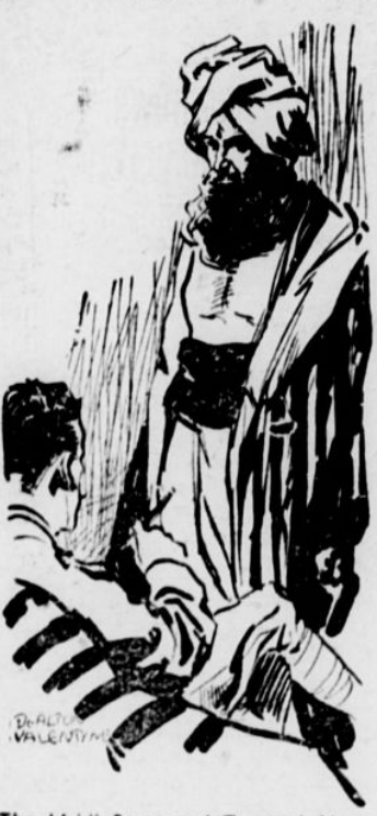
The Afridi Came and Towered Above Them.

"When did she say so?" King asked him blandly. The hillman stroked his great beard and stood considering the question. King entered a shrewd suspicion.