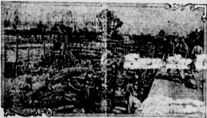
SOLDIERS IN THE VERDUN SECTOR REPAIRING A RUINED CANAL