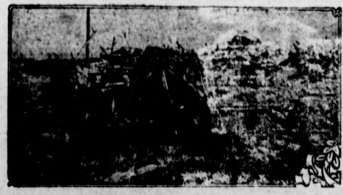
IN THEIR RETIREMENT FROM OCCUPIED TERRITORY THE GERMAN ARMY DESTROYED MILLIONS OF DOLLARS OF AGRICULTURAL MACHINERY.