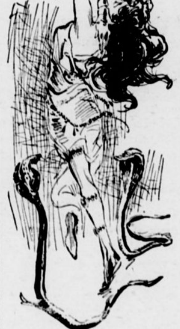
As She Danced She Whirled Both Arms Above Her Head and Cried as the Werewolves Are Said to Do on Stormy Nights.

He seemed to have been at sight of the Afridi. Turning through the glass-bead curtains at the door, the great savage