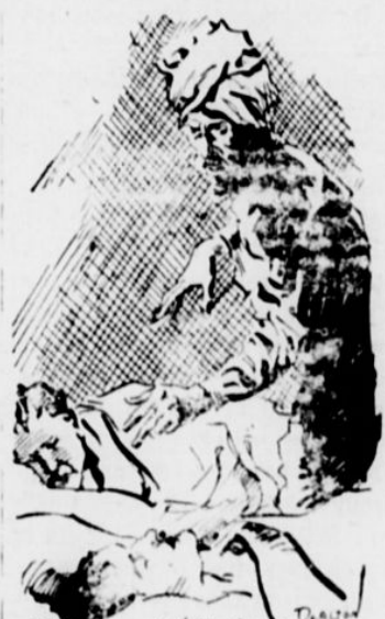
He Feigned Sleep So Successfully That the Native Turned Away at Last.

For about five minutes, while the train swayed headlong into Indian darkness, the man stood listening and watching King's face. He stood so near that King recognized him for the one who had accosted him on Rawal