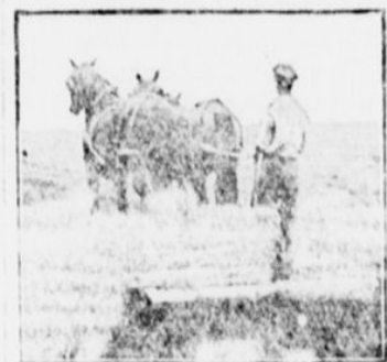
Dragging Road in Fall.

If clay is mixed with water and "puddled" and then allowed to dry a hard, almost waterproof, and nearly dustless material is formed. If a smooth, well shaped road could be constructed of this material it would never become very muddy or very dusty, and would be an ideal earth road. Under ordinary conditions this ideal is not realized, because, after being puddled the earth dries in ruts and holes which are rough while dry and which hold water like dishes when it rains. If the muddy road, after