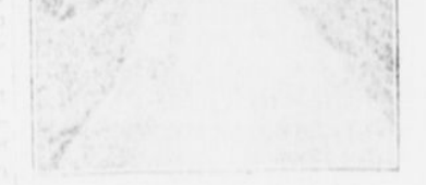
Good Road in West.

For years very little attention has been given to the waste of land in our road building. Land has been cheap and plentiful and years ago we did not