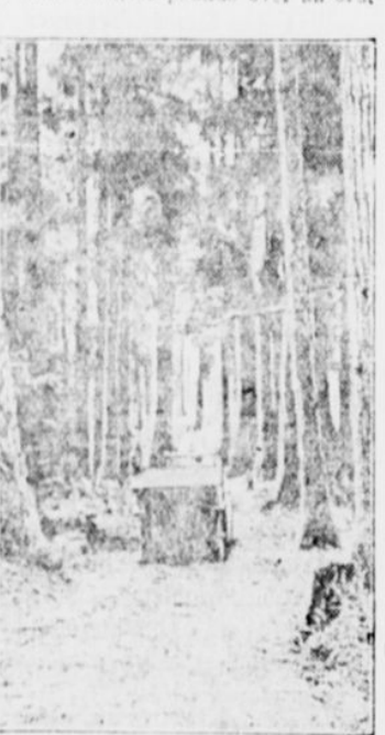
Road Through California Forest.

Tests have shown that a pull of 27 to 30 pounds per ton of gross load was needed to haul the wagon on unfurfaced concrete roads. When the concrete was surfaced with oil and screenings the pull was increased to about 50 pounds. About 65 pounds were needed for hauling on water-bound macadam and on bituminous concrete laid on top of cement concrete. On good gravel roads a pull of 65 to 82 pounds was needed, while on loose gravel the pull was 263 pounds, the highest record in any of the tests. About 80 pounds were required for hauling on bituminous macadam. On earth roads 92 pounds were required for hauling over a good surface covered with 1 1/2 inches of loose dust, 99 pounds over an ordinary dirt road with dust 3 inches deep in places, and 218 pounds over a muddy earth road.