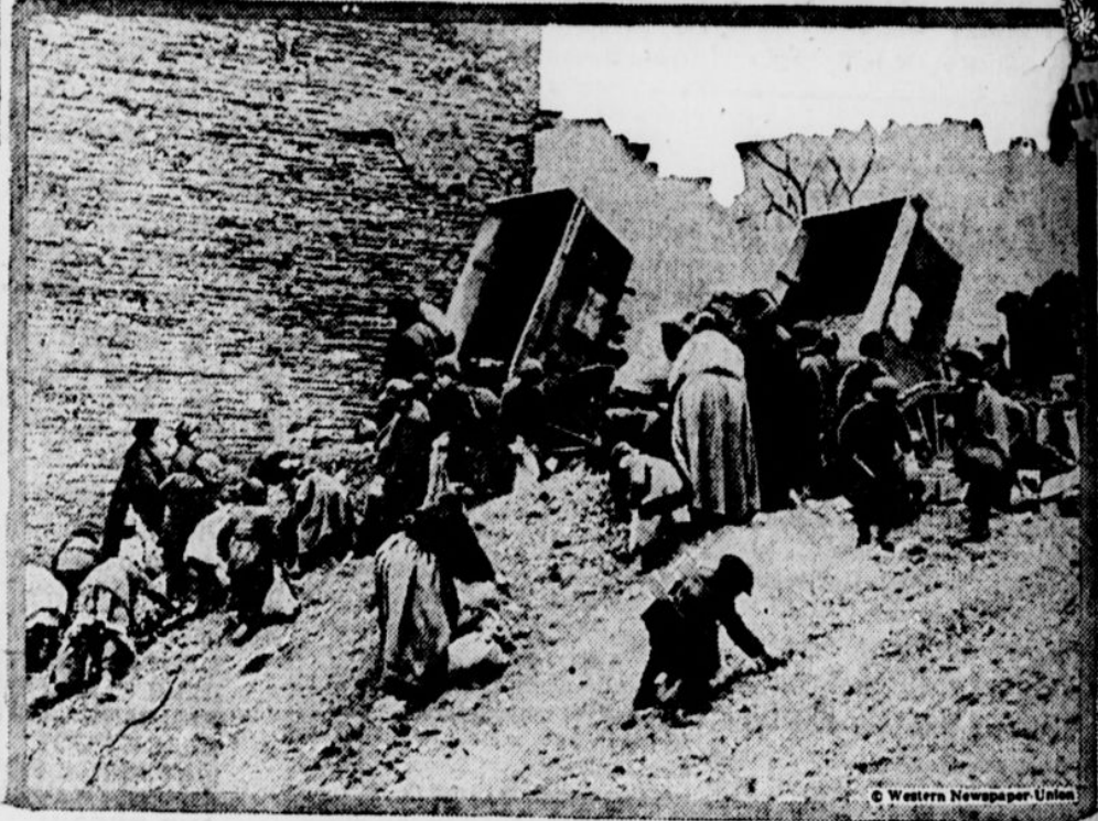
Some idea of the scarcity of fuel in the East is gained from this photograph, showing poor people of the East Side of New York digging for coal in the city ash heaps on the site of the $12,000,000 courthouse that is to be erected.