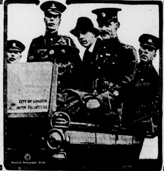
Officers of the first seven divisions of the British army that entered the war in France, called by themselves the "Old Contemptibles," were given a great reception in London when they returned from prison camps in Germany.