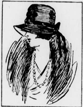
New hat for the spring. It is of dark red straw with a large flower worked out in worsted in the front.

Satin will continue in favor and there is mention of a revival of the "wool-back" variety, which had some