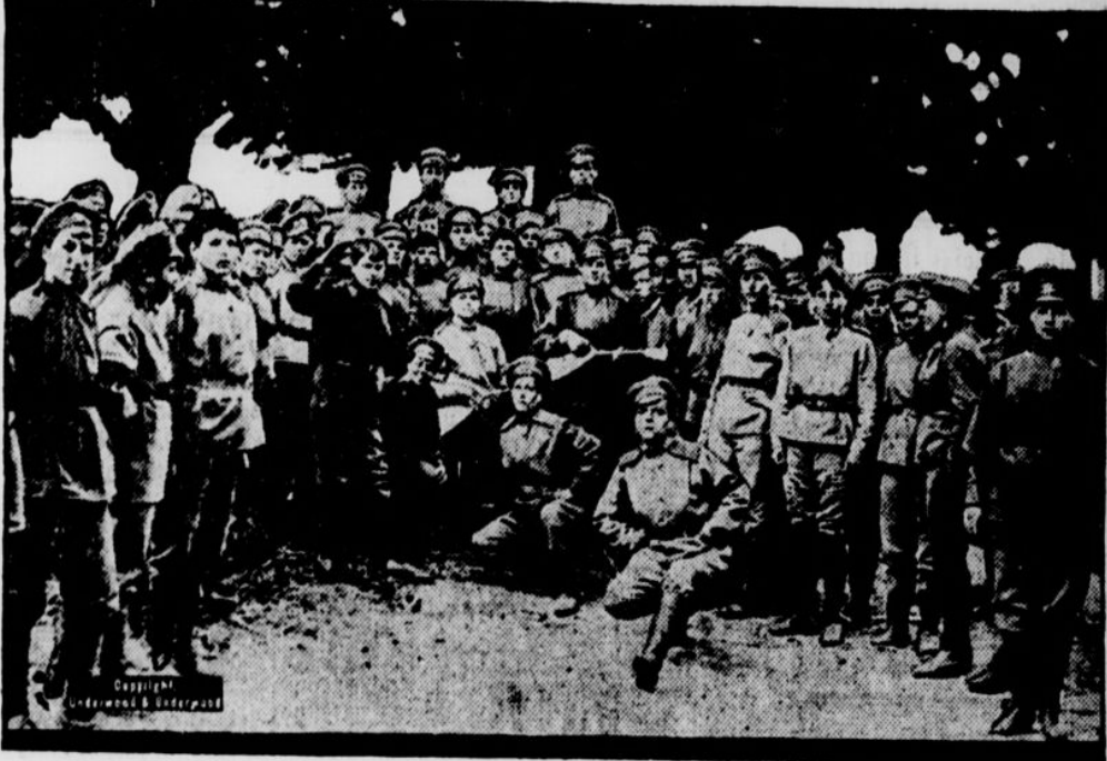
Fighting is new to the Russian women, and the tension for them is much greater than for the men. To relax from their warlike vigilance, they hold dances and play games in their camp. This unusual photograph shows a few of the women entertaining the other members of the regiment. They all belong to the Battalion of Death.