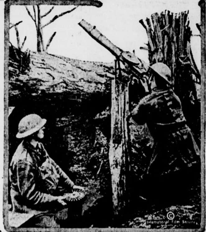
These Australian machine gunners are in a hole formed by a shell-shattered tree. They are having a pot-shot at a Boche airplane.