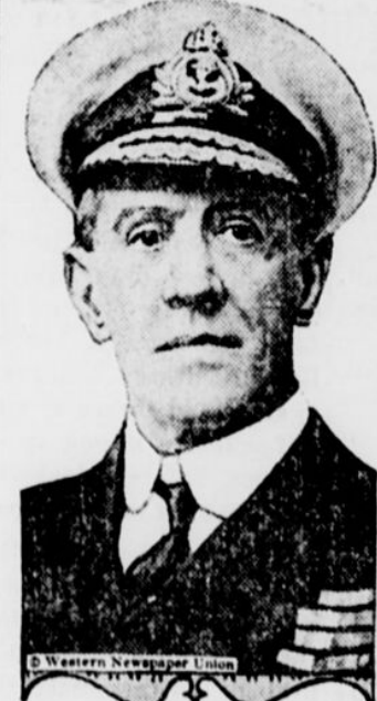
Admiral Cecil Buxton of the British navy who is in command of the fleet patrolling the coast of Scotland.