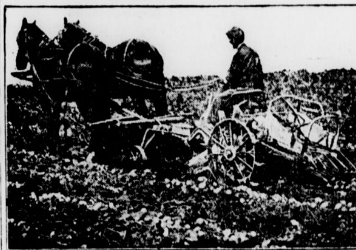
All Practicable Machinery That Can Take Man's Place Should Be Utilized—Mechanical Potato Diggers Save Hand Operations.