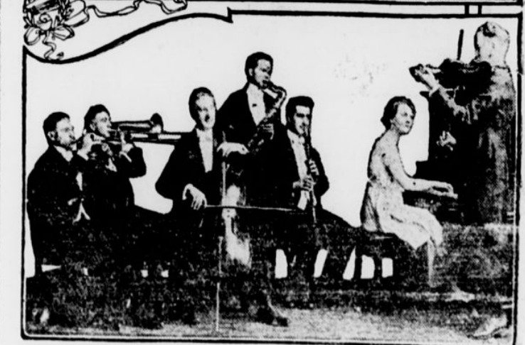
CHICAGO ORCHESTRAL BAND.

The Chicago Orchestral Band, which will give a grand concert on the sixth afternoon of the Redpath Chautauqua here and a pleasing prelude at night, was organized by the famous bandmaster, Bohumir Kryl, which fact is in itself sufficient guarantee of the musical excellence of this company, for Mr. Kryl is not only known everywhere as a bandmaster and cornet virtuoso of supreme artistry, but he has achieved a remarkable success as an organizer of musical companies. Mr. Kryl is well known on the Redpath Chautauquas over which his own band has toured several times.