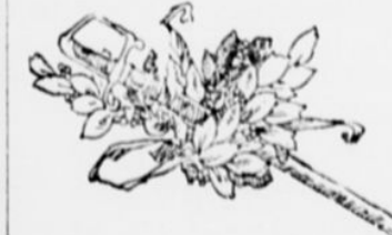
Ex-Confederates Draw Pensions.

For the cause which the men of the Grand Army of Republic upheld is the same as the cause which the young men of today have rallied to uphold. It is the cause of America, in the sixties as now, the champion of justice and freedom.