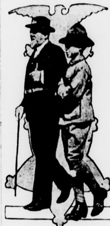
With His Grandson in Khaki.

But the hearts of these heroes in blue—these men who offered the last measure of sacrifice to their country more than half a century ago—are as sound as they had been in the remote period of their youth. They beat as high to the inspiration of the crisis through which the country and the world are living. These men who played a manly part in one of the