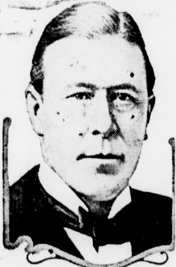
SIR JOHN FOSTER FRASER, F. R. G. S.

Sir John, who is a native of Edinburgh, Scotland, has done more varied