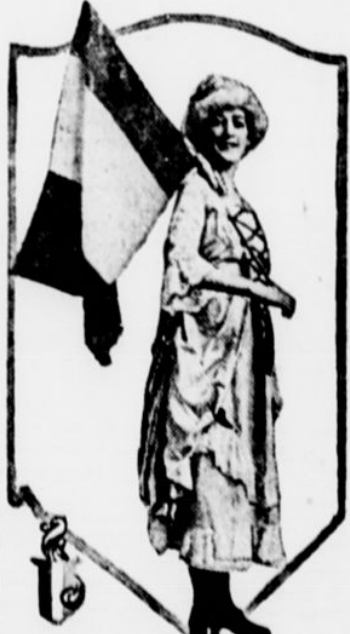
FRANCE FROM DUNBAR'S REVUE.