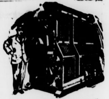
During the period of the War, we will not sell an American Midget Roller Mill unless its purpose is to supply the local needs of a community, or our Government, with flour and feed.

It will be news to most persons that a great many former Confederate soldiers draw pensions from the government. Some of them were deserters who enlisted in the Union armies; others were prisoners of war who did the same thing. Six regiments of so-called "penitent rebels" were organized by the federal authorities from the prison camps at Point Lookout, Rock Island, Alton, Camp Douglas and Columbus. They took the oath of allegiance, and the men were credited to the quotas of the states they elected to serve.