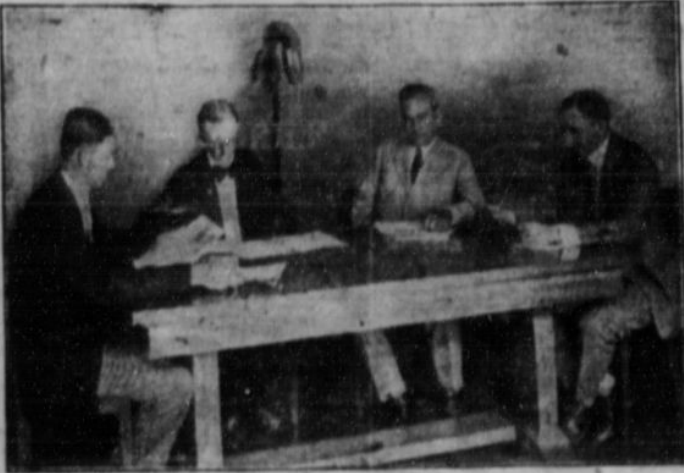
Legislative Committee, Ky. Farm Bureau Federation.

Below is a Facsimile Reproduction of a Resolution Advocating Passage of Two Amendments