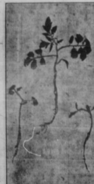
Root-knot on Young Tomato Plant.

Another example is that of root-knot of a wide variety of plants, so injurious in the southern part of the country and occurring also in some of the more northern states. It would be impossible to state how much root-knot there was in the South 50 years