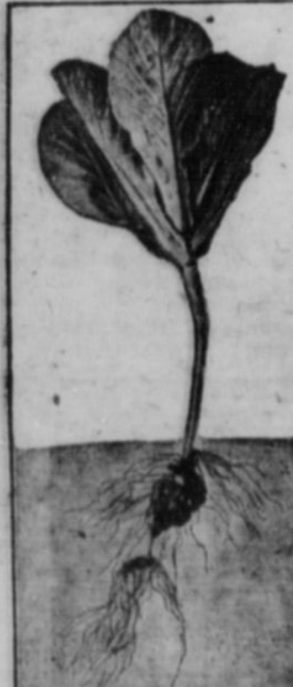
Clubroot on Young Cabbage Plant.

When putting prepared roofing on poultry houses, it is a decided advantage to unroll the roofing and to let in light and sunshine for a few hours. The roofing expands from the warming and lies smoother when applied to the roof. The inside of the roll is cooler than the outside air, and so if not placed in the sun before application, it will expand after nailing and produce wrinkles.