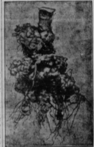
Clubroot in Advanced Stage.

Wilt constitutes another group of diseases that may be transmitted to