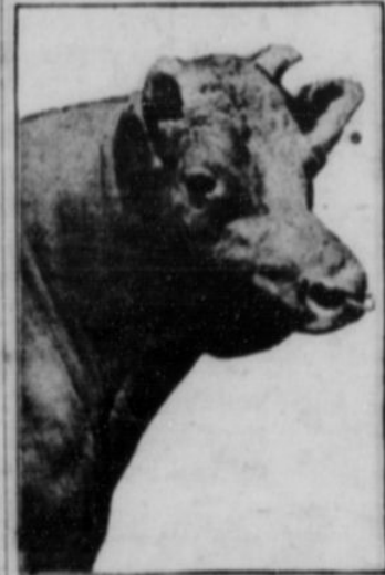
A Purebred Sire.

Except when the open range is involved, however, or there is need to control inferior sires from running at large, specialists of the bureau prefer a continuance of educational work to legislation. They place emphasis on the fact that the work, although in-