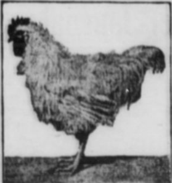
Male Frizzle—Feathers Have Not Dried Like This From Recent Washing, but Grow in This Unusual Fashion.

Types of Plumage and Form. The ear lobes of all Polish chickens are white, the eggs are white, and the hens are classed as nonsitting or non-