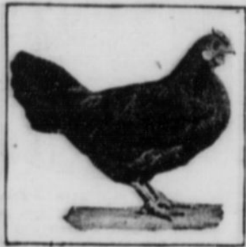
Golden Pencil Hamburg.

Ornamental breeds and varieties may and often do possess considerable economic value, and some of them undoubtedly could be developed, ac-